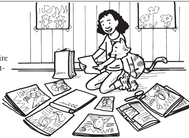
Photo walk. Go for a walk together, and let your child take pictures of scenes that might lead to a story. She could snap a photo of a fire truck speeding past with its lights flashing or of a frozen lake shimmering in the sun. At home, she

can look at the pictures and write a story about a courageous rescue or an ice hockey game.